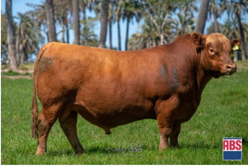
BULL: AR 0290-DOM FLOR

29AR0290 | Dom Flor TE221 Capané Ebola 11